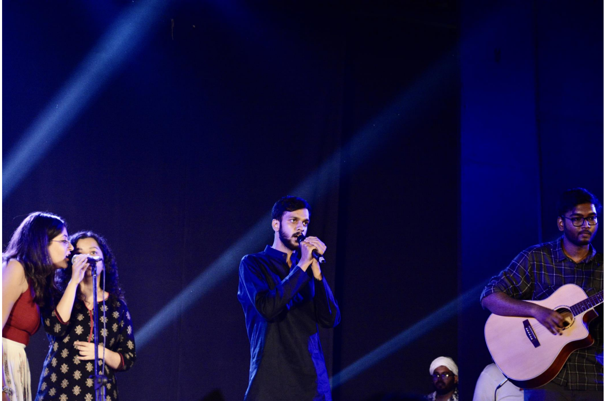
Performance by the College Musical Band “Udaan”