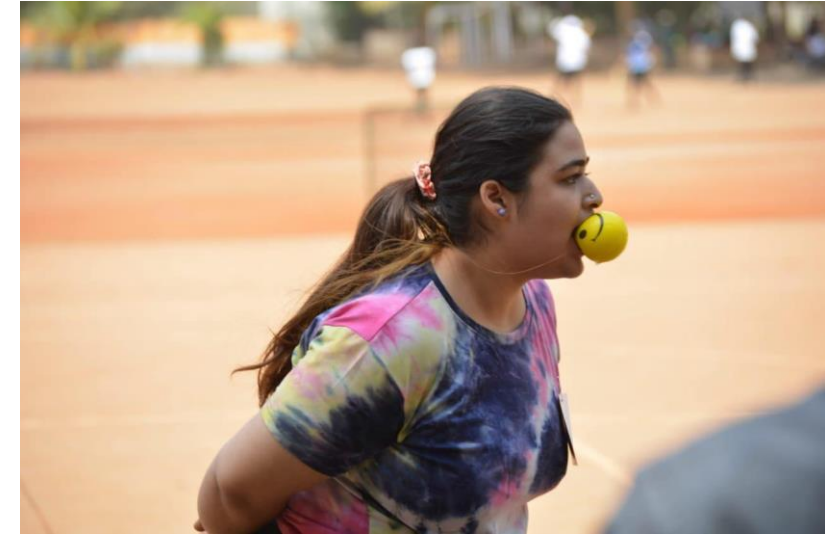
Ball in the mouth race