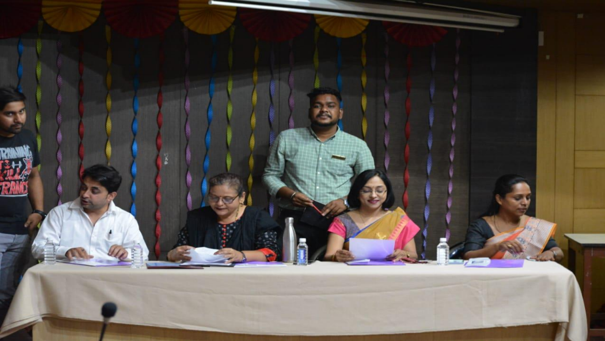
Interview Panel Of Mr. & Miss Abhinay