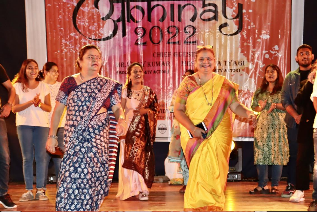
Inauguration of the Abhinay Crew T-shirts