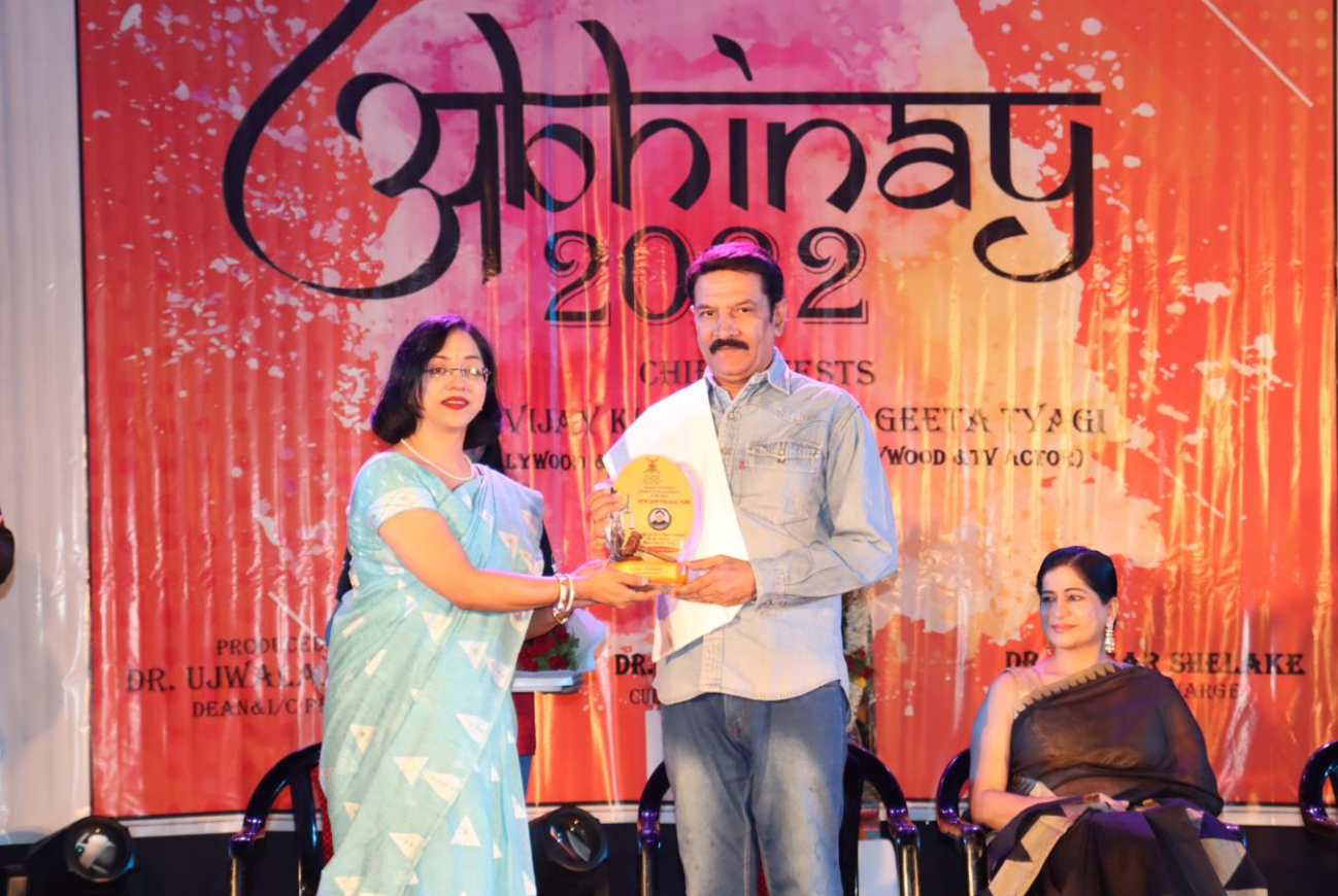
Felicitations of the Chief Guests by The Principal Ma'am