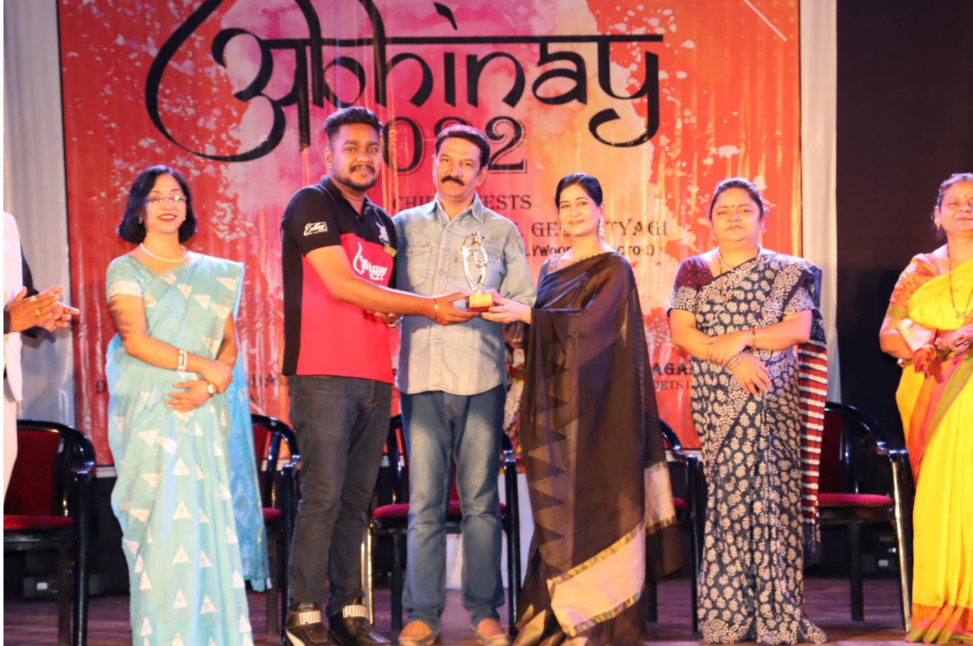
Felicitation of The Cultural Student Coordinator