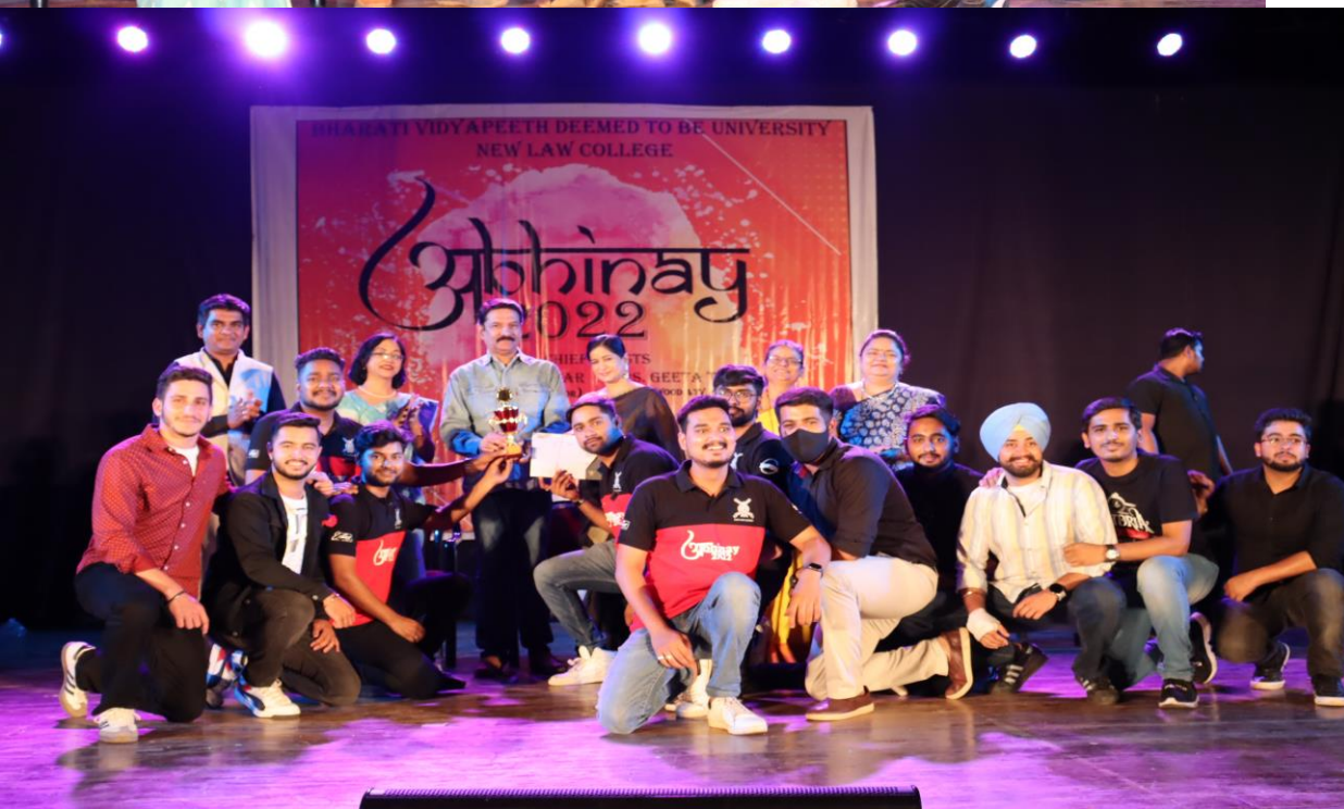
Winner of Tug Of War Competition