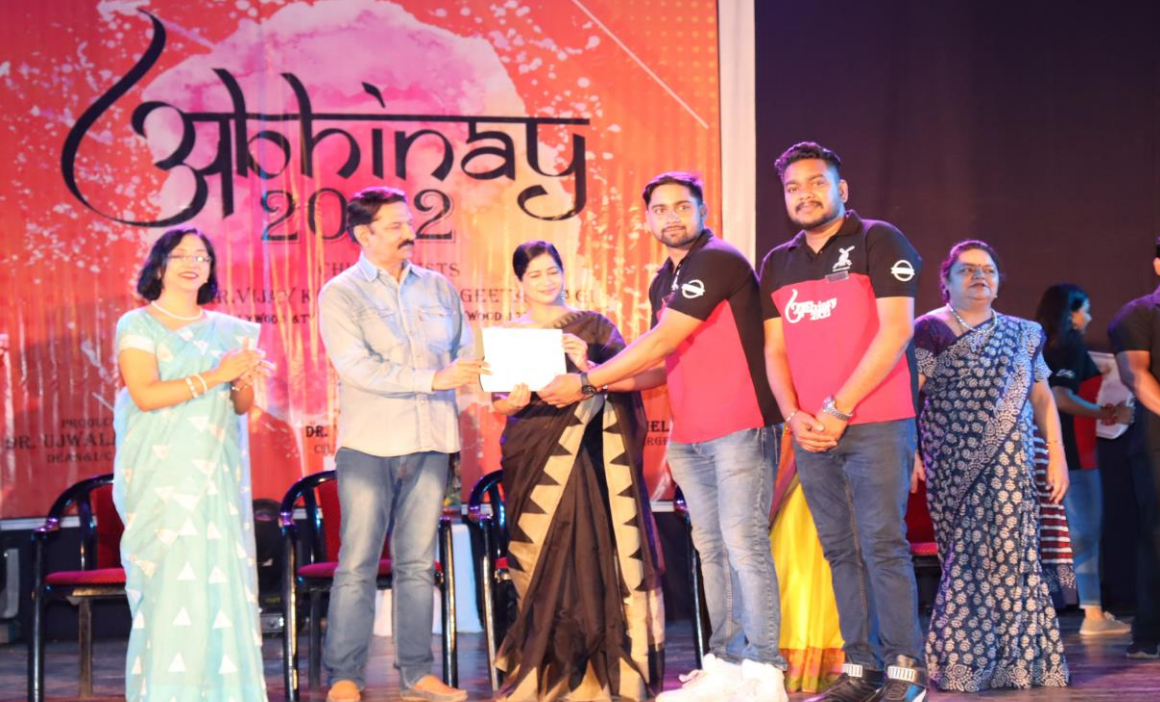
Winner of NLC Basketball Championship