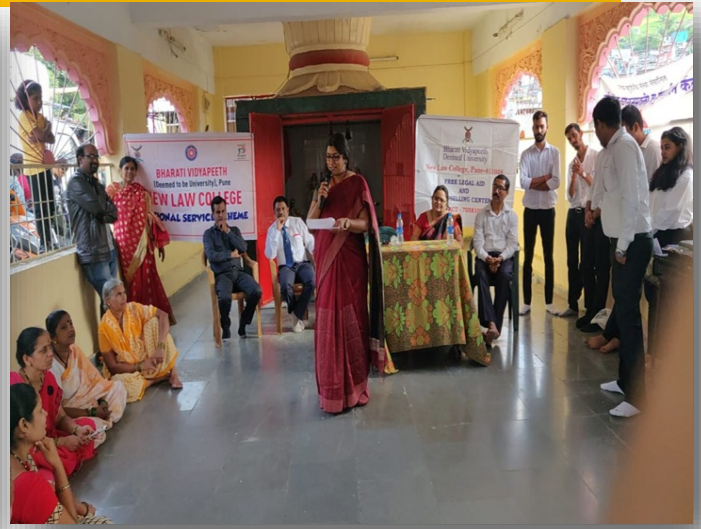
AWARENESS PROGRAMME FOR TEENAGERS ON 'CYBER CRIMES & ITS EFFECT' WAS CONDUCTED AT RAMBHAU MALGI SCHOOL, KATRAJ (27/07/ 2019)