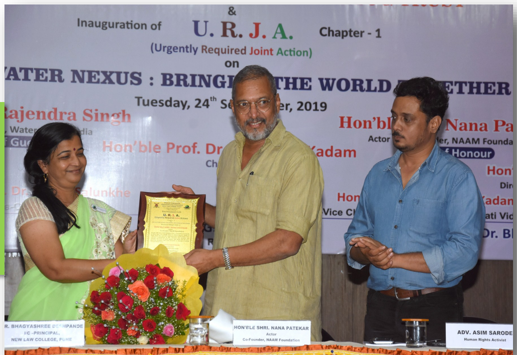
Hon'ble Shri Nana Patekar the famous Cine Super- Star & Co-founder, NAAM Foundation.

“If we have no peace, it is because we have forgotten that we belong to each other”.