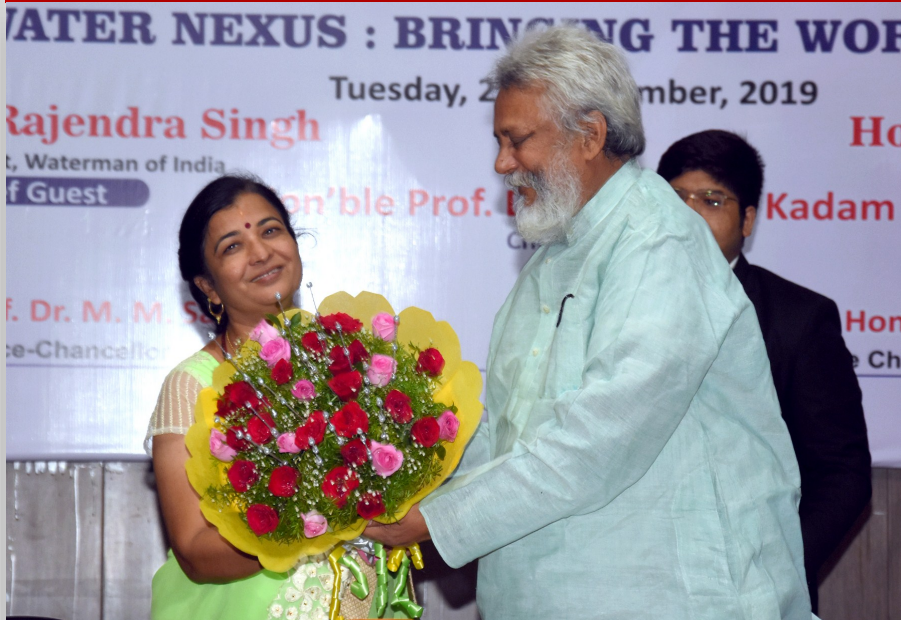
Hon'ble Dr. Rajendra Singh, the water-Man of India & renowned Environmentalist

In association with the SAHYOG Trust, the College had organized a National Seminar on “The Water nexus: bringing the World Together” which was graced by Hon’ble Dr. Rajendra Singh, the water-Man of India & renowned Environmentalist as well as Hon’ble Shri. Nana Patekar, the famous Cine Super-Star and Co-founder, NAAM Foundation.