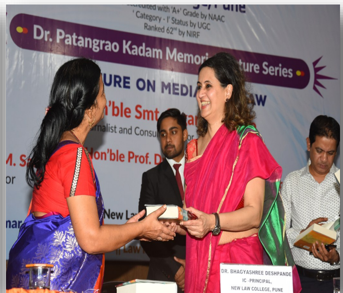
Hon'ble Ms. Sagarika Ghose- Consulting Editor, Times of India

In order to make our students understand the complicated issues of media with law, the College had invited none other than Ms. Sagarika Ghose herself, who is a well known face in the Media World and known for her liberal interpretations of Media and Law those present. issues. Presently working as the Consulting Editor from the Times of India, Ms. Ghose warily scanned all the problems that revolve around media and highlighted how law could be helpful to the media personnel in covering news on day to day basis. A book authored by her named- "Why I am a Liberal" was also circulated among those present during the function.