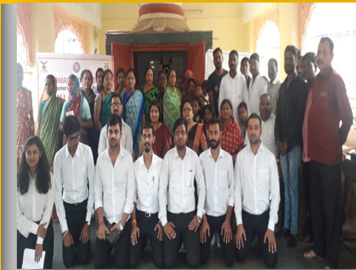
AWARENESS ON "ADDICTION OF MOBILES IN SOCIETY" -(03/07/ 2019)