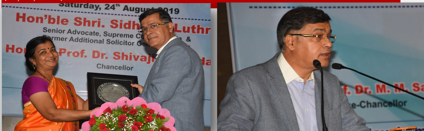
Hon’ble Sr. Adv. Sidharth Luthra- Former Additional Solicitor General of India

The celebrated lawyer, Hon’ble Shri Sidharth Luthra, Senior Advocate, Supreme Court of India, & Former Additional Solicitor General of India was invited to the institute to deliver a legal discourse on “Bail Jurisprudence and the Law on Sedition”. The theme of the discourse was quite something that warranted specialized experts’ opinion. Adv. Luthra successfully dealt with the issue in depth and encouraged the students to apply logic before approaching the court of law for the matters pertaining to bail.